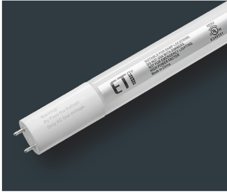
4' T8 LED Shatter Resistant Tube 12w 1800 LM 4000K & 5000K