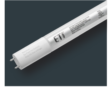
4' T5 LED Glass Tube 25w 3500 LM 5000K