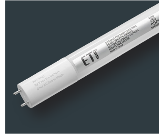
8' T8 LED Glass Tube 43w 5500 LM 5000K