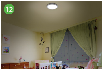
BEDROOMS Flushmounts Downlights Cove Lighting NightLightR

Click on links for access to detailed stock product information.