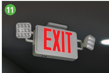
HALLWAY/STAIRWELL Exit Lighting Panels Wrap Lights Sconce