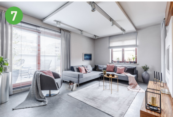
FAMILY ROOM Recessed Lighting Flushmount Lighting Track Lighting