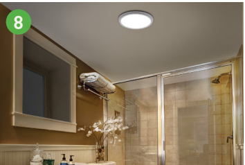
BATHROOMS Recessed Lighting Flushmount Lighting Vanity Mirrors/Lights Fan Lighting