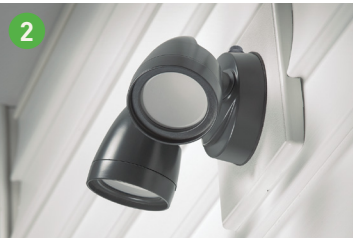
OUTDOOR SPACES Bollards Floodlights Wall Packs Security Lighting