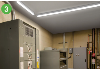
MECHANICALS Strip Lights Ceiling Lights