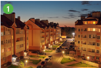
PARKING AREAS Pole Mounted Area Flood Lighting