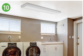
LAUNDRY ROOMS Recessed Lighting Flushmount Lighting Fan Lighting