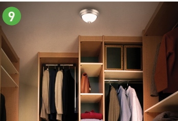
CLOSETS Spin Lights® Flushmounts