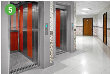
LOBBY Panels Downlights