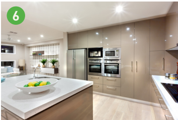
KITCHENS Recessed Lighting Under Cabinet Lighting Flushmount Lighting NightLightR