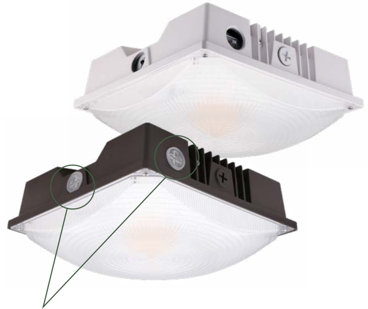
Easy Access to Wattage & CCT select switches